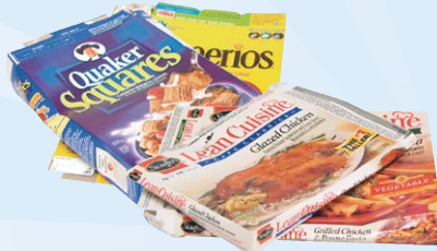
unwaxed paper or frozen food boxes