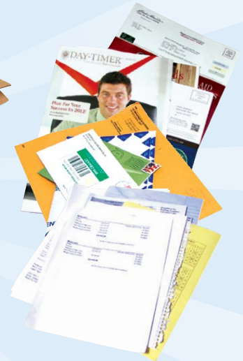
mail, magazines, mixed paper and catalogs