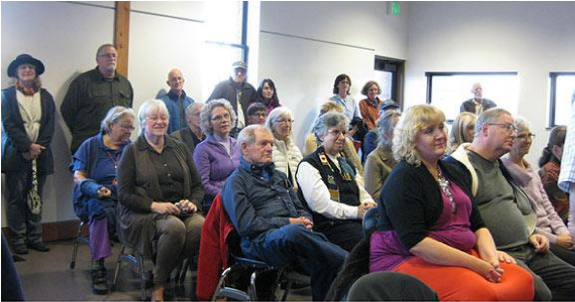
We enjoyed a full house at the annual Angel of the Arts and Patron of the Arts award ceremony held at the Cotton Building.